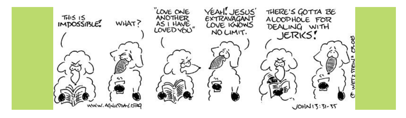
Agnus Day appears with the permission of <a href="http://www.agnusday.org/">http://www.agnusday.org/</a>