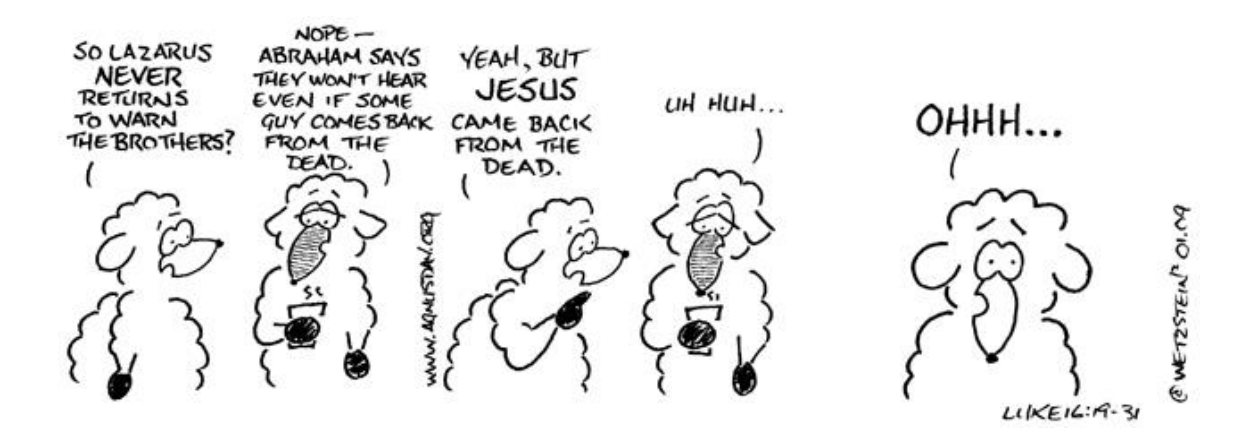
Agnus Day appears with the permission of <a href="http://www.agnusday.org/">http://www.agnusday.org/</a>