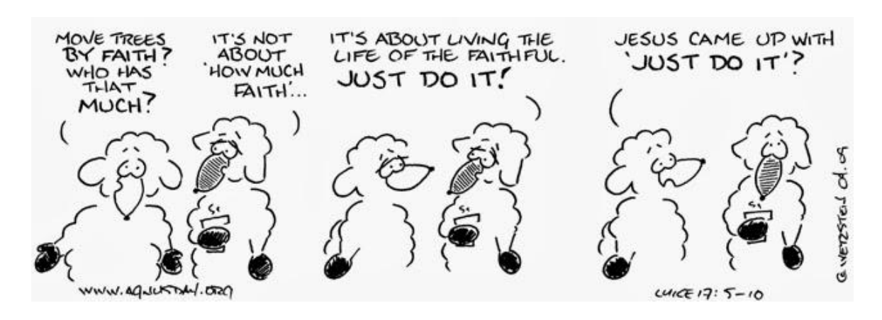
Agnus Day appears with the permission of <a href="http://www.agnusday.org/">http://www.agnusday.org/</a>