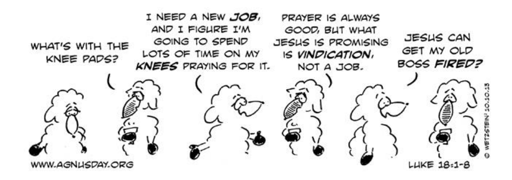
"The Holy Gospel according to St. Luke, the 18th Chapter"

As an example of the "scholarly discussion" visit <a href="https://bible.org/article/relation-qeovpneusto-grafhv-2-timothy-316">https://bible.org/article/relation-qeovpneusto-grafhv-2-timothy-316</a> for an 8 page discussion of verse 16 only.