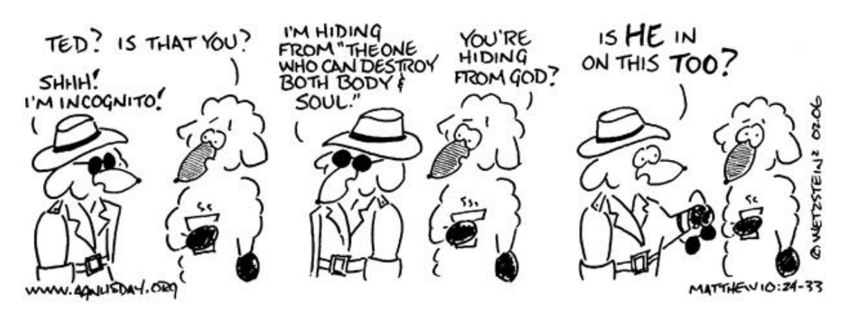
Agnus Day appears with the permission of <u>http://www.agnusday.org/</u>