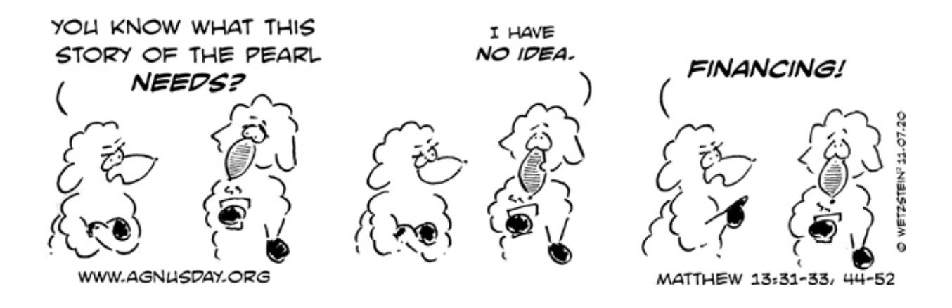
Agnus Day appears with the permission of <a href="http://www.agnusday.org/">http://www.agnusday.org/</a>