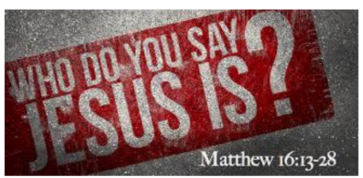
https://www.elimbcc.ie/who-do-you-say-jesus-is-matthew-1613-28/ Ballyfemont Community Church is located at the heart of Ballyfemort in Dublin.

August 24, 2017 (Thursdays at 10:00 AM) Bethlehem Lutheran Church, 7500 State Road, Parma, OH 44130 Presented as a part of the bible study/worship weekday service (currently on Fridays at 7:00pm) in a house church setting, bi-weekly at an assisted living site and used by Lutherans in Africa. E-mail puritaspastor@hotmail.com for details.