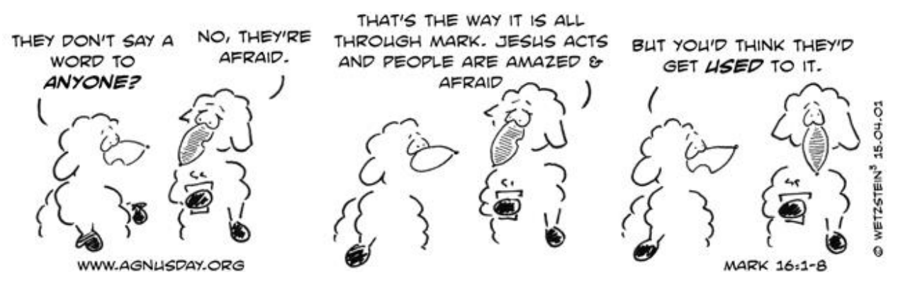
Agnus Day appears with the permission of <a href="http://www.agnusday.org/">http://www.agnusday.org/</a>