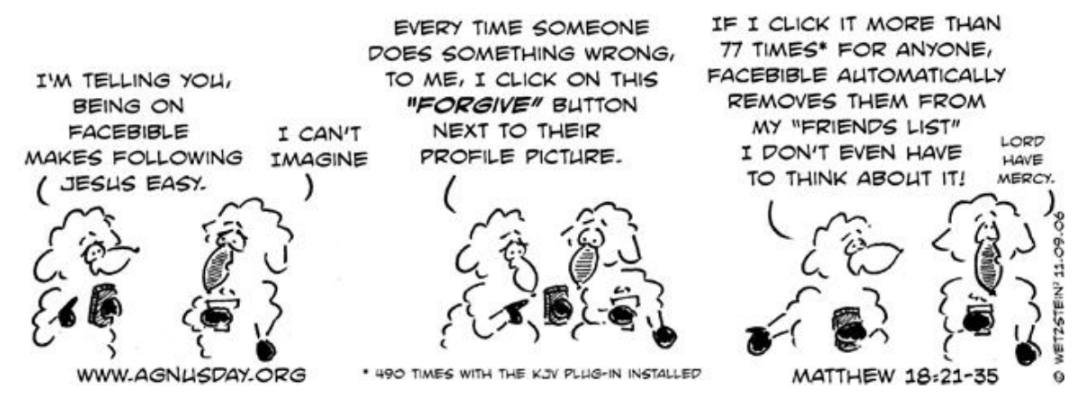
Angus Day appears with the permission of <a href="https://www.agnusday.org/">https://www.agnusday.org/</a>

The Matthew Challenge It is 28 chapters long (1071 verses or 18,345 words, subject to the translation). Break that down to a schedule that works for you. If you are starting now, your new pace is 2.3 chapters per week (up from 2 weeks per chapter), or about 13 verses per day (up from three verses per day.) Did that scare you off or encourage you?